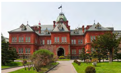
Old building of Hokkaido Government

Ramen is an extremely popular noodle dish in Japan. Among the different types of ramen, miso (fermented soy paste) ramen is originally from Sapporo, making "Sapporo miso ramen" famous all over Japan.